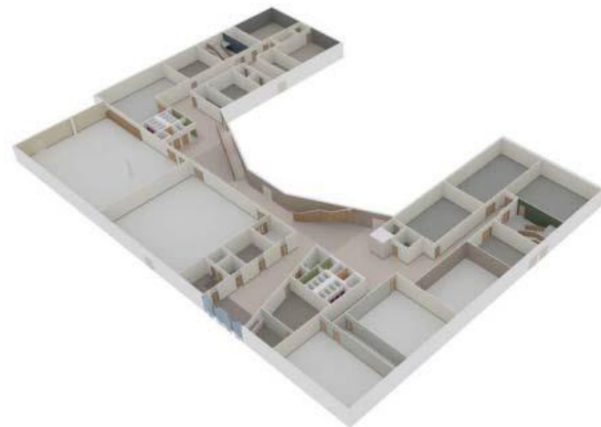
GROUND FLOOR LEVEL