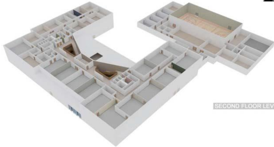
SECOND FLOOR LEVEL