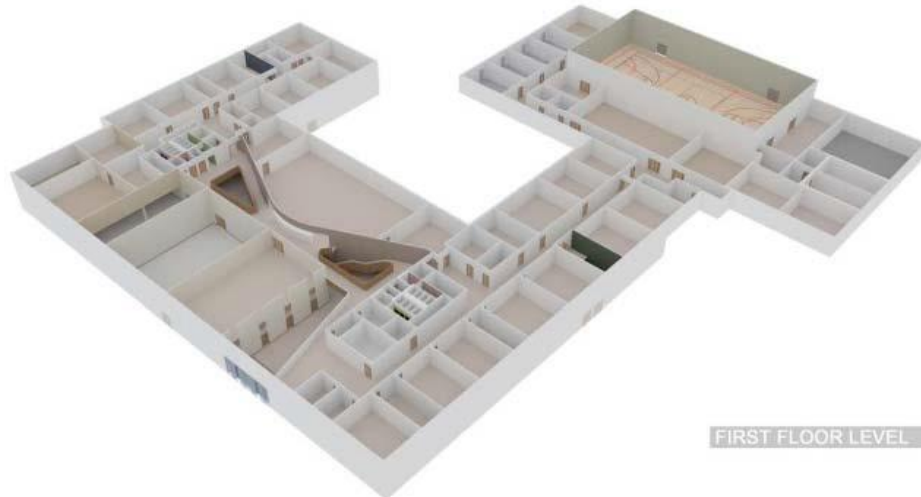
FIRST FLOOR LEVEL